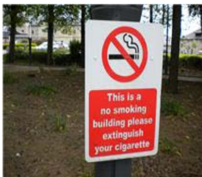
Department of Health Notice amongst some trees