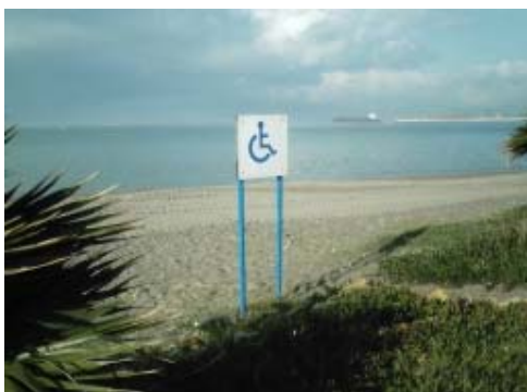
Sign seen on Spanish Beach

This picture depicts there are disabled facilities on this beach in Spain, as seen and taken by one of our members whilst he was on holiday there.