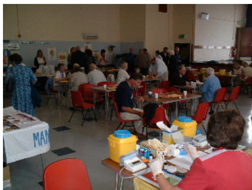
General view of the proceedings

No doubt this is because of the existence of the Manx Diabetes Centre with its multi-disciplinary team which is now the envy of those across the water and second to none.