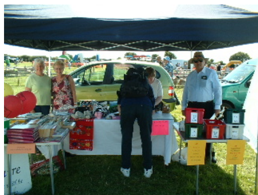
The stall at the South Agricultural Fair.

The Friends of the Manx Diabetes Society once again had a stall at the Southern Agricultural fair.