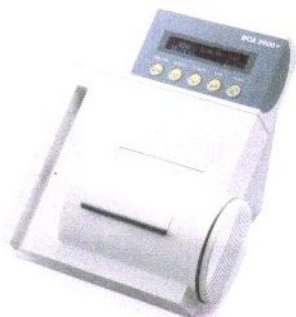
The DCA2000+ Analyser

analytical results, so there is no waiting as the results will be available in 6 minutes.