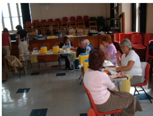
Finger pricking in action

The multi-disciplinary team of the Manx Diabetes Centre were manning ten stations